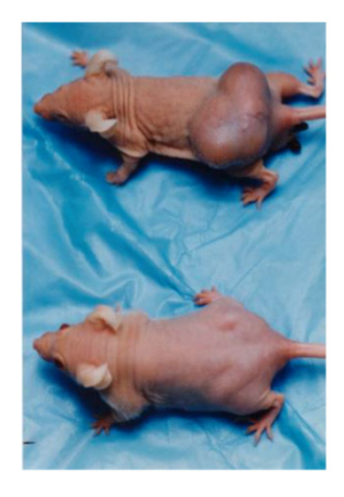
Fig 3. demonstrates the ability of the monoclonal antibody for Colon Cancer targeting the immunogenic tumor antigen for tumor regression. The animal given a non-specific antibody had progression of tumor growth. Antibody was not given along with the human cells that then did or didn't establish tumor growth but was used for treatment only after the large tumor growth became apparent.