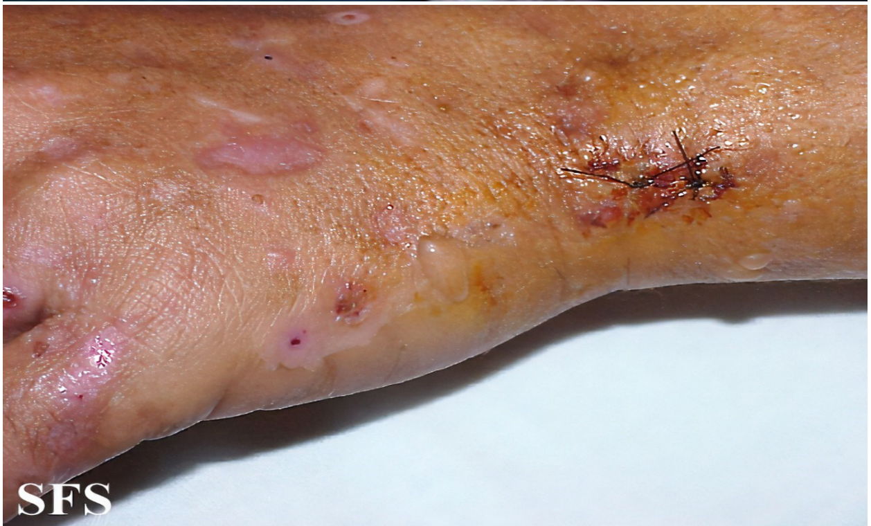
E- Porphyria Cutanea Tarda