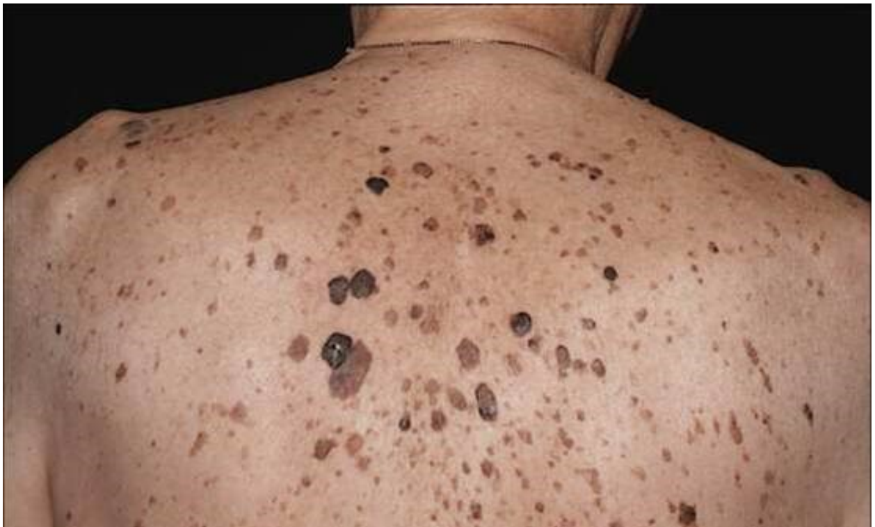
G- Laser Trelat