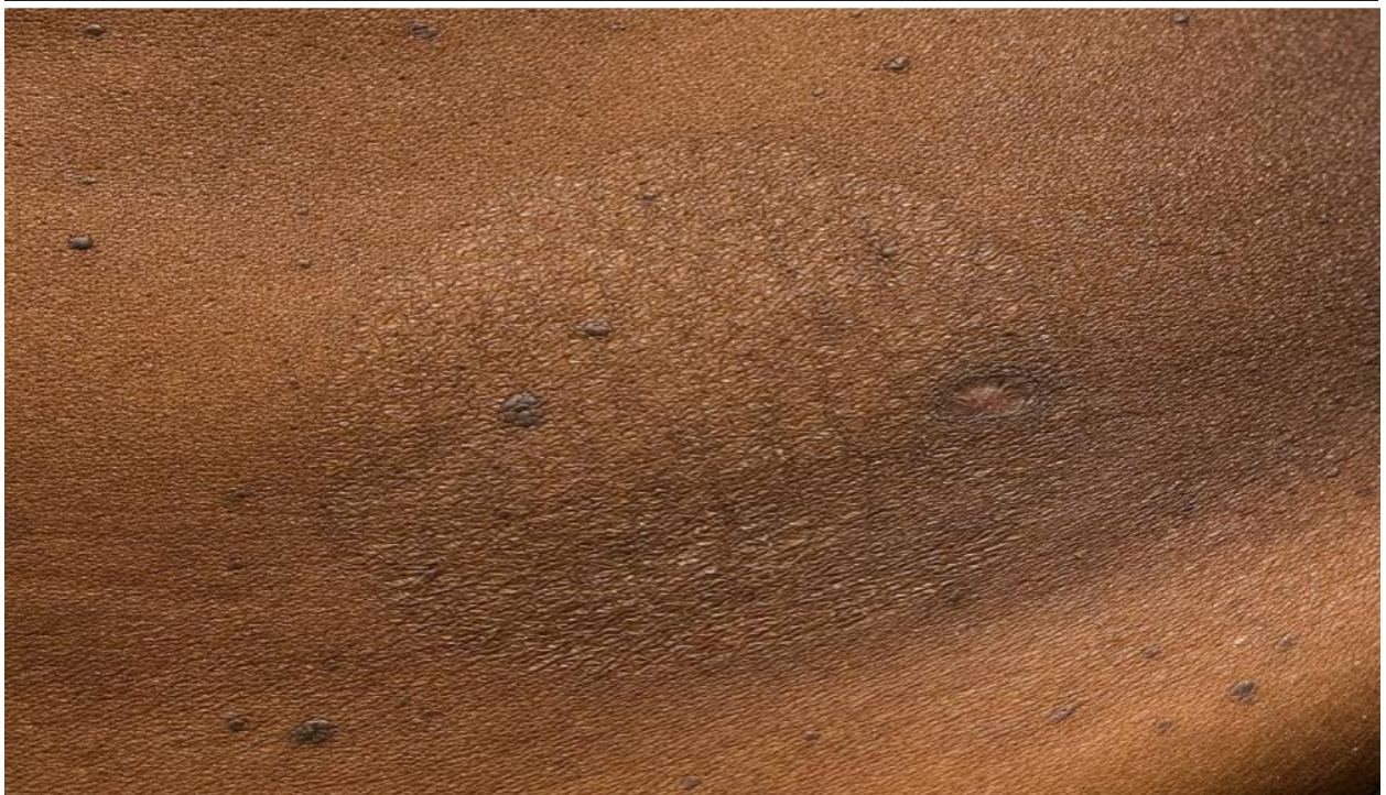
I- Pityriasis Rotunda