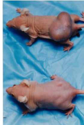
Fig 3. demonstrates the ability of the monoclonal antibody for Colon Cancer targeting the immunogenic tumor antigen for tumor regression. The animal given a non-specific antibody had progression of tumor growth. Antibody was not given along with the human cells that then did or didn't establish tumor growth but was used for treatment only after the large tumor growth became apparent.